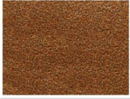
129 Rustic Copper - 129