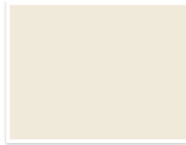
132 Cameo - 132