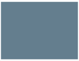
009 Colonial Blue - 009