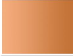
890 Solid Copper - 890