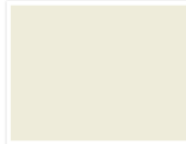
017 Linen - 017