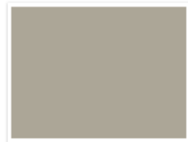
008 Clay - 008