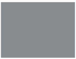
014 Dove Gray - 014