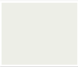
023 80° White - 023