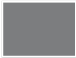
028 Paint Grip Metallic - 028