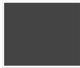
025 Dark Bronze - 025