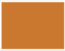
027 Copper Metallic - 027