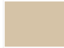
013 Wicker - 013