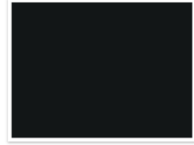
004 Black - 004