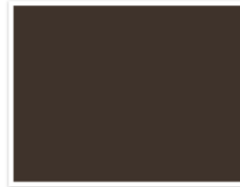
011 Musket Brown - 011