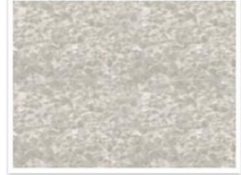
920 Galvalume Plus Steel - 920