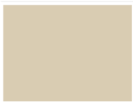
005 Raffia Beige - 005